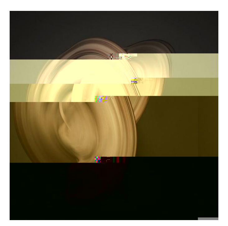
Fig. 1. Shinichi Maruyama, Nude 9, 2012

an end. I began to look at my own use of the technique as a way to represent the odd nature of the passage of time in hypnagogia and the dream state beyond.