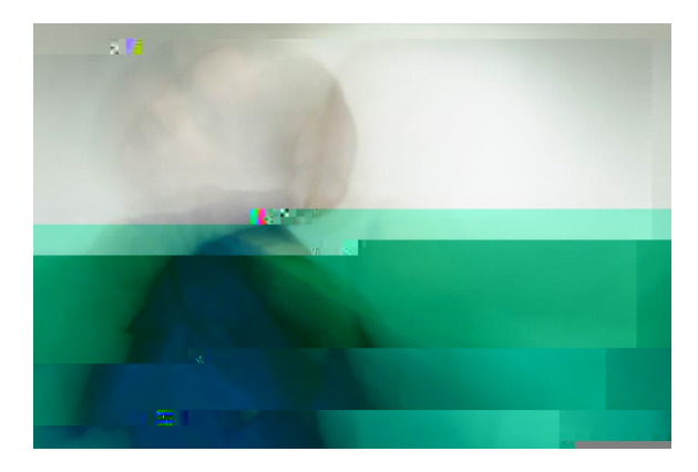
Fig. 5. Kathryn Reichert, I Would Go With You, 2018