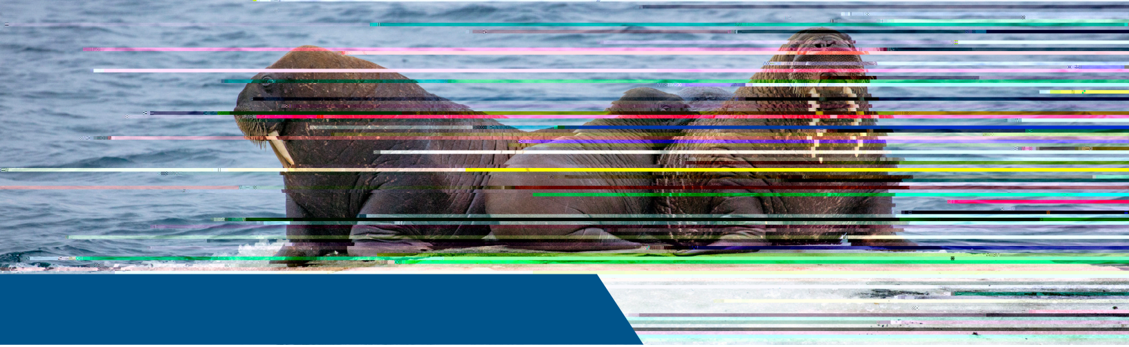
Walrus rest on sea ice in the Arctic.