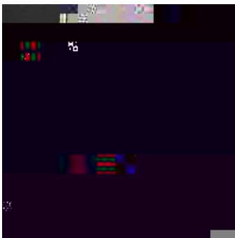
Left: Sketch of 1860 total solar eclipse showing a coronal mass ejection.