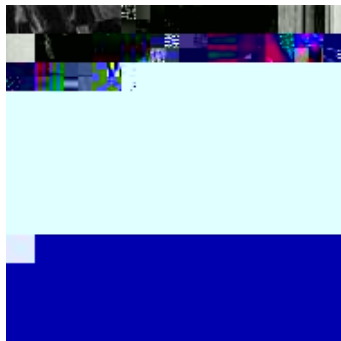
Athabascan woman stitching a birch bark basket.

Dené (Athabascan) basket makers are aware of birch bark's ability to hold water. They collect birch bark in the spring or early summer, taking only the outer layer so that the tree will survive. The bark is cut, warmed to make it flexible, folded into shape, and stitched together with split pieces of root from spruce or willow trees. Baskets are made in a variety of shapes and sizes for different purposes.